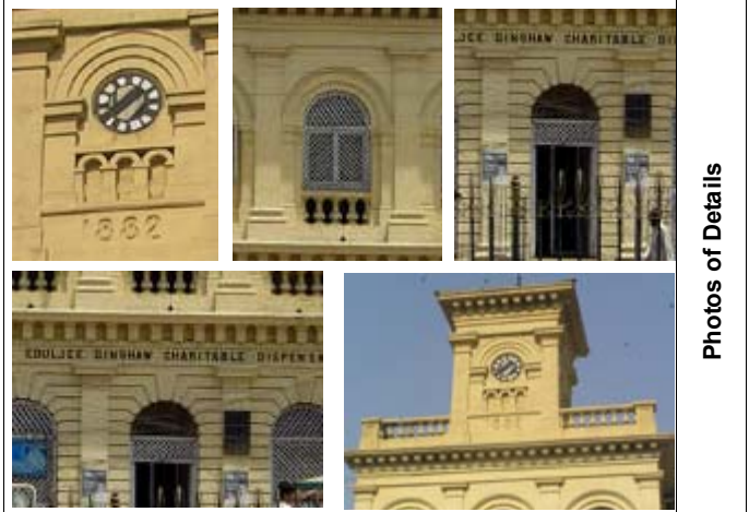
Photos of Details