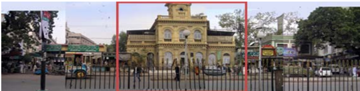
Photo / Montage Indicating Streetscape Setting: